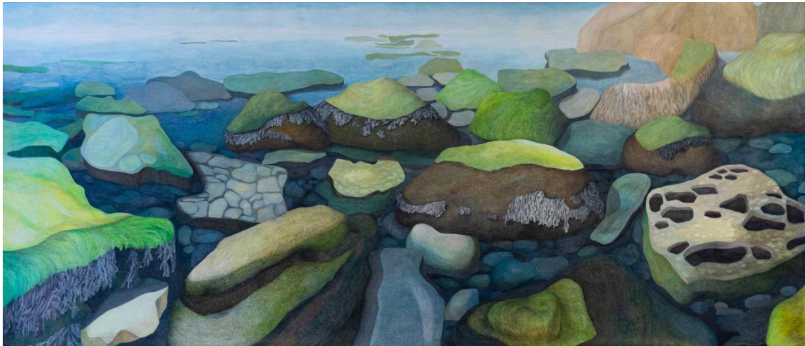
Ninet Kaijser, Tide, 440x196 cm, colored pencil on paper

We herald the latest edition of Art Month Ameland with the fascinating theme 'Unlimited'. Artists, as explorers, explore the boundaries of the abstract and the figurative, reality and illusion in their creations. And they invite you to be taken to a new horizon of wonder. An interesting example of this is the famous work by Piet Mondriaan: 'Victory Boogie Woogie'. While he initially worked based on nature with matching colors, gradually brighter colors were added and everything became more abstract. Is the painting a checkered pattern, the street plan of New York or a vase? As a spectator you cannot help but admire his innovative vision.